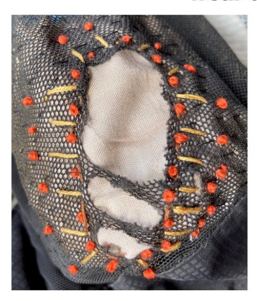
Have you some much loved clothes with holes? Would you like to be more sustainable with your fashion? Like to learn more about fabric repair? Interested in chatting to like minded people? Come stitch with us!

Don't throw it away, mend it and celebrate the wear and tear!