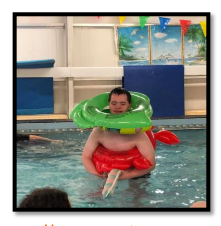
Have a great summer

We have been around the world in our class MFL lessons and done cookery and crafts from different countries. We also took part in the whole school European market. Treacle represented Portugal by doing some drumming and cooking some delicious tarts.