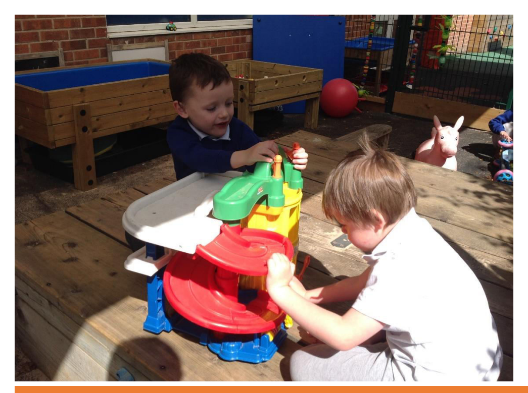
THIS TERM OUR TOPIC HAS BEEN: FARM ANIMALS