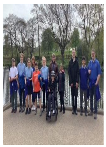
Bollin Class-Community visit.