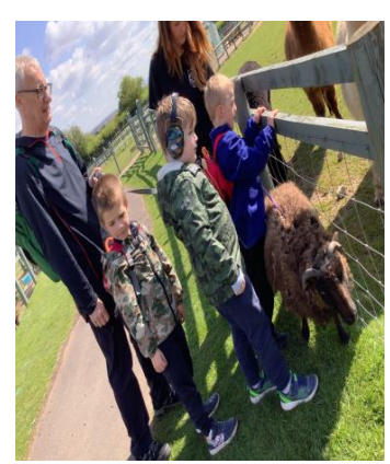
Silk class visiting Children's Adventure Farm Trust.